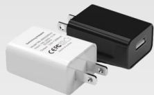
PT-03 (5V 2a )