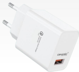
PT-06 (18W )