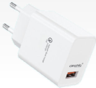
PT-06 (18W )