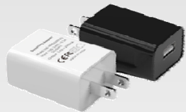
PT-03 (5V 2A )